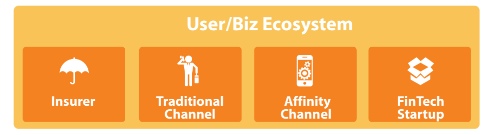
Figure 1. eBaoCloud: Business View